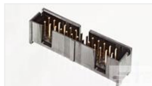
TE Part #5103308-8 A/L LOW PRO HDR 40P VERT BLACK