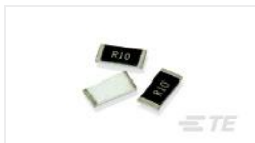
TE Part #6-1622825-1 RL73K 2A R47 5% 5K RL