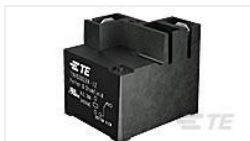
TE Part #3-1419104-9 T9AS5D22-5